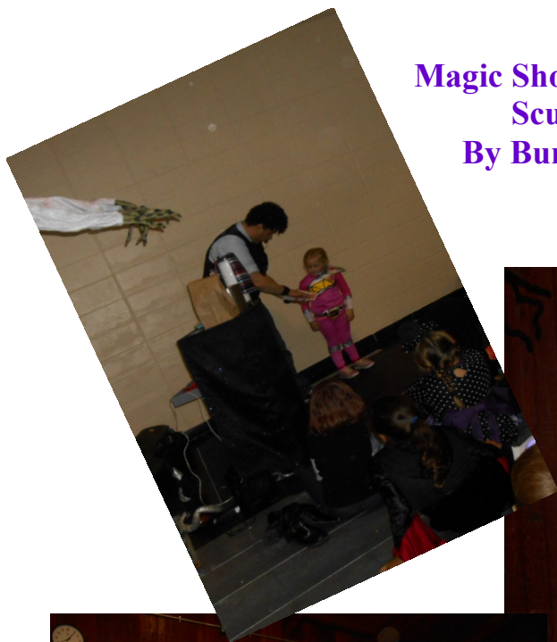
Magic Show & Balloon Sculpting By Burke Magic

Thanks to everyone who attended the party, and to all the volunteers who helped make it a success! A fun time was had by all!